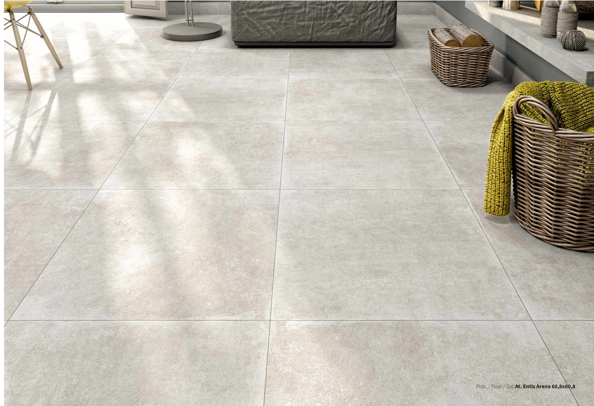
Pvto. / Floor / Sol: At. Entis Arena 60,8x60,8